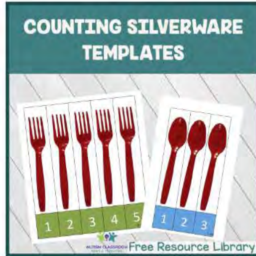
Silverware Counting Templates Read More...