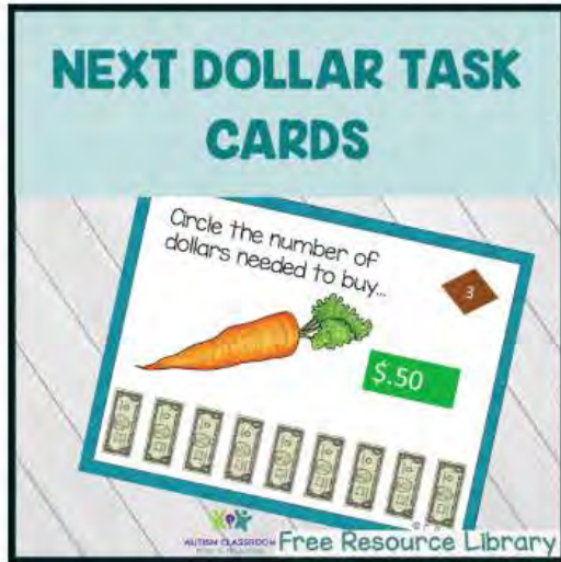
Next Dollar Task Cards Read More...