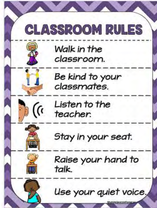
Free Visual Classroom Rules Read More...