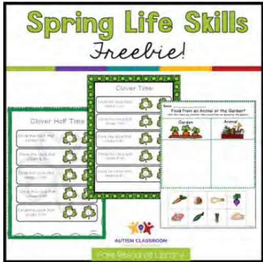
Spring Life Skills Read More...