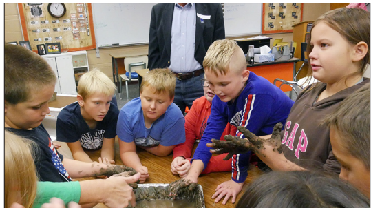
Students at Tescott Grade School, Twin Valley USD 240, studied erosion and weather through project-based learning.

This is the education system Kansas is building through its Kansans Can School Redesign Project.