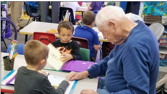
The Age-to-Age program at Windsor Place Nursing Home is a partnership between Coffeyville USD 445 and Windsor Place Nursing Home that began in 2008. The intergenerational environment pairs kindergarten students with residents, also known as "grandmas and grandpas," who have years of life experience to share. Students read to the residents and vice versa.

Kansas State Department of Education (KSDE) leaders, along with Kansas State Board of Education members, conducted more than 20 community conversations with teachers, parents, business leaders and community members across the state before setting a new vision for education. Kansans said academic skills are important, but so are nonacademic skills, such as critical thinking, teamwork, perseverance and civic engagement. Kansans also said we need to move away from a "one-size-fits-all" system that relies exclusively on state assessments to measure student success. The new, student-focused system will provide support and resources for individualized success.